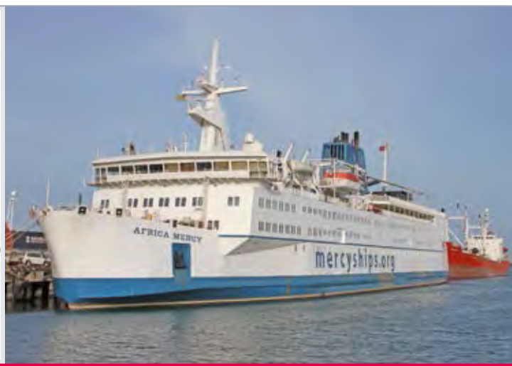
Powered by 3 x L21/31 GenSets

The development of the L21/31 engine completes the MAN GenSet programme. The engine covers the power range between the L16/24 and the L27/38 engines. All in all, a marine GenSet product programme for the 21st century.